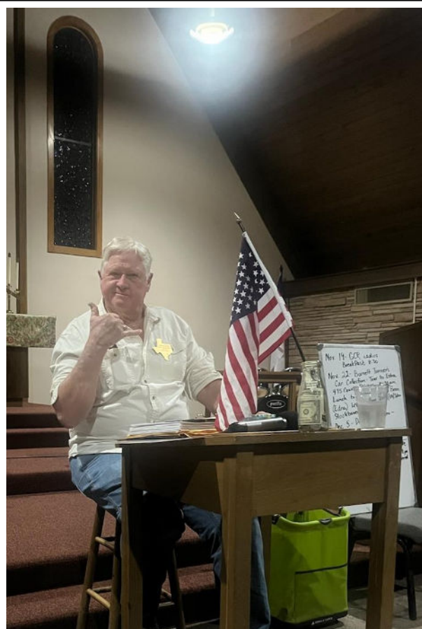
Our Club President conducting the meeting.