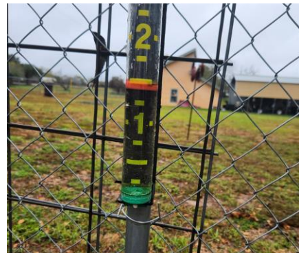
C.C.T. plus an inch and a half or rain